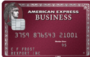
Plum Card® from American Express