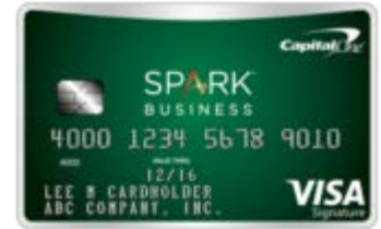
Capital One® Spark® Business Cash