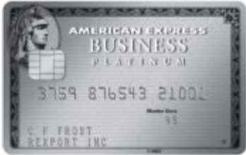
Business Platinum® Card